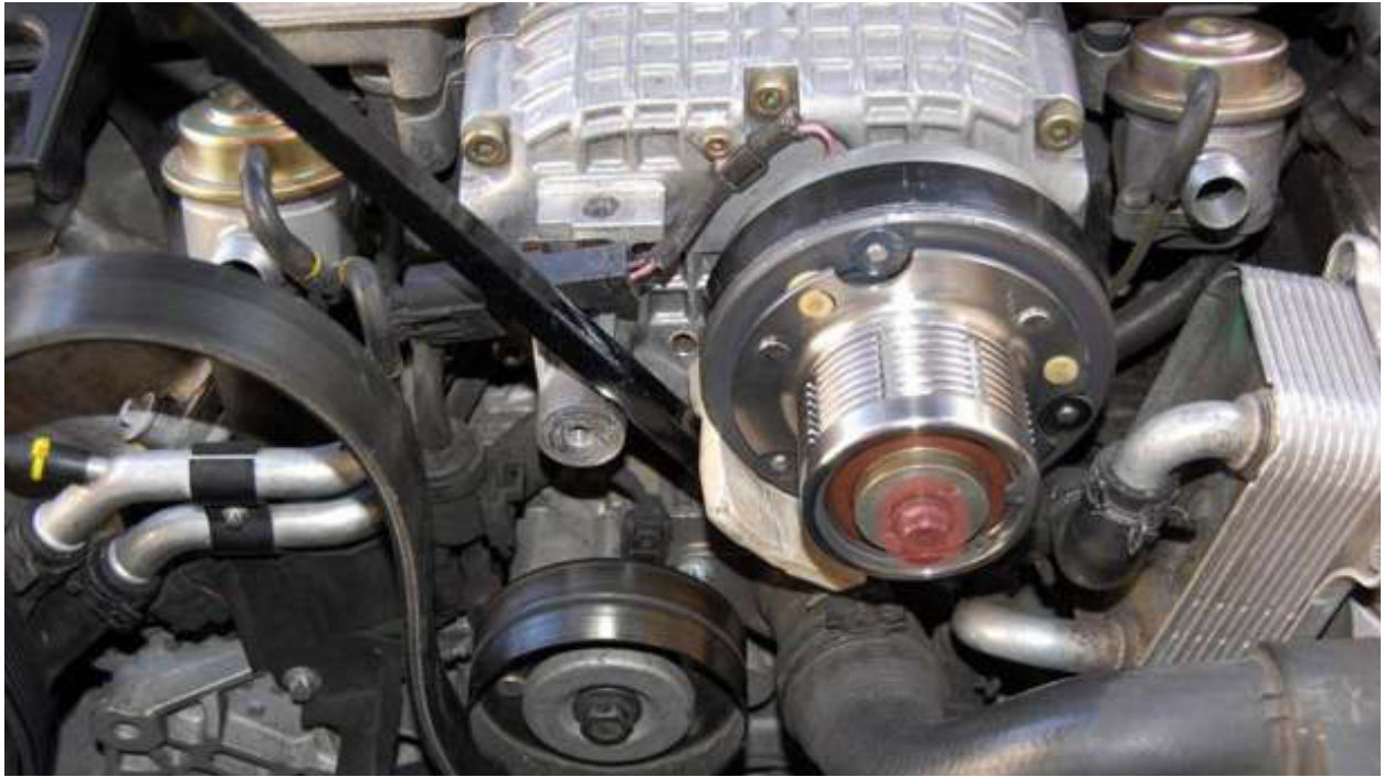
Step 5- Remove the bolt and washer from the front of the pulley